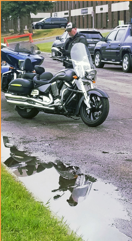
Steve was one of several VRC members who showed up to volunteer at 2WS.