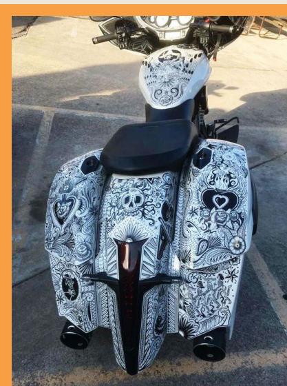
Hand-painted sugar mask XC by Soul On Iron.

And the prize? We'll think of something; and it will be great. Bragging rights are a bonus.