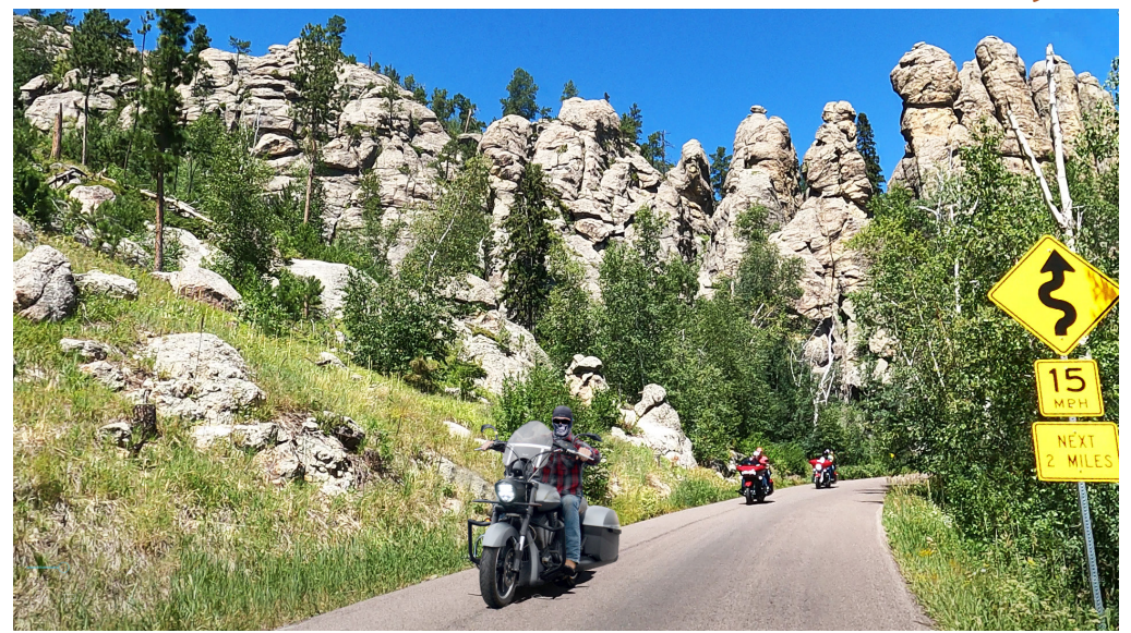
Yes, that sign says 15mph curves for the next two miles, such is riding the Black Hills.