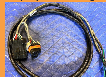
Trunk plug and play harness. Offers?