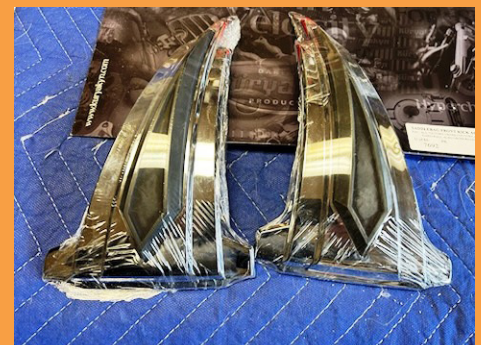
Kuryakyn saddlebag accents $50