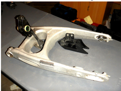
Swing Arm Assembly with Tighteners, Belt Guard and Pushrod (no Shock)