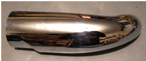
Heat Shield (small ding)