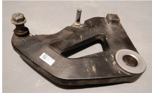
Rear Caliper Hanger