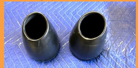
Black exhaust tips $50