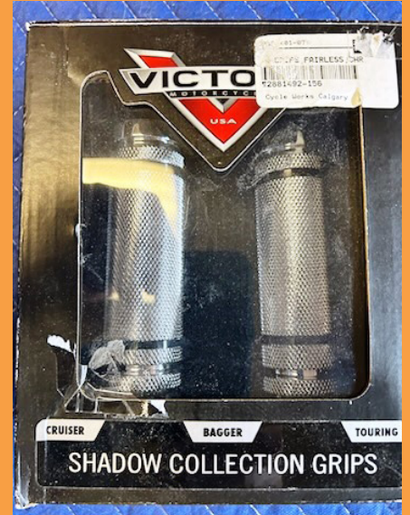
Chrome grips $75