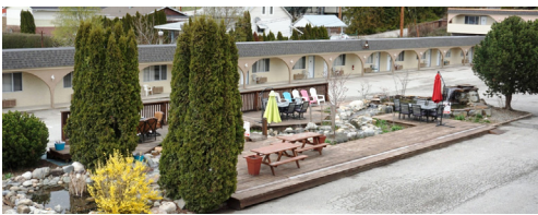
Magnuson Hotel, Creston, B.C.

Next Meeting April 23 10:15 am Lighthouse Pub 1140 137 Ave SE, Calgary Breakfast Meeting Ride to follow, weather permitting