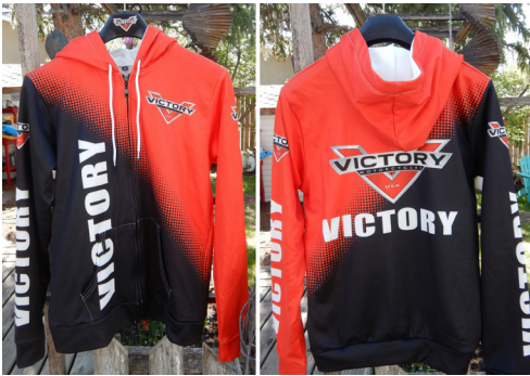
Colourful (to say the least) Victory full zip hoodie. Tagged size Small, but closer to Medium. $50 OBO