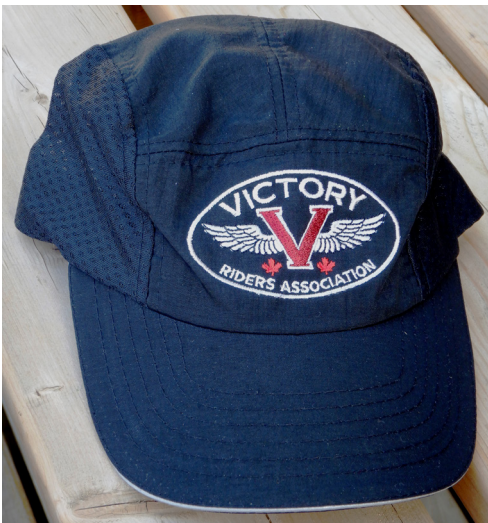
Four vintage, Velcro-adjustable VRA mesh-side baseball caps . Black with grey brim trim. Apparently liberated from the Penticton Chapter. $10