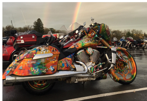
Is there anyone who doesn't know who this unique Cross Country belongs to? Who has visited him in Dallas?