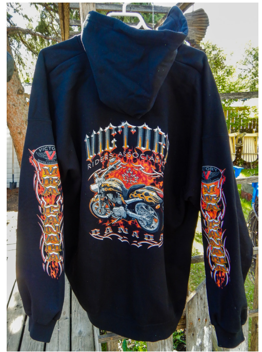
Two heavy, full zip, black Victory Riders Association vintage hoodies. One Size 2XL and one Size 3XL. Plain front. VRA Canada artwork on back and sleeves. $30