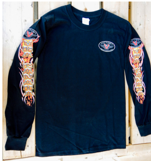
Three size Small black Victory Riders Association vintage long-sleevers. VRA oval logo on front. VRA Canada artwork on back and sleeves. $10