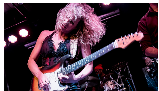
Blues great Ana Popovic knows our pain. Her new album Power features the song Ride with the line, 'Til the wheels fall off.