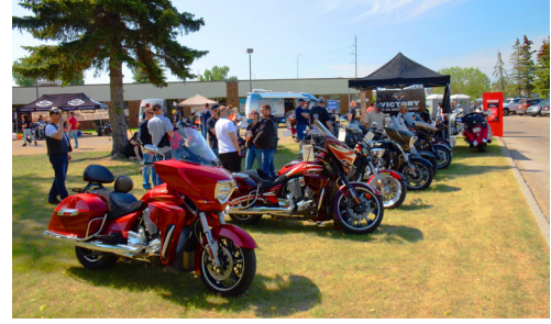
From every angle, it was an impressive display of Victory motorcycles and gear.

Two Wheel Sunday organizers commented on the statement that the club made, putting together a great display, and congratulated us on making such a fine showing. As one club member said, "We owned Two Wheel Sunday."