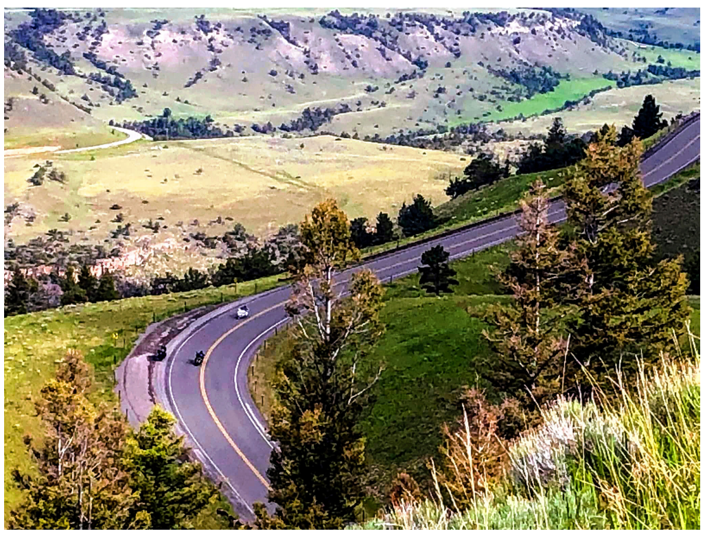
Highway 296, the Chief Joseph Scenic Byway, is one of the most under-rated motorcycling roads in North American, overshadowed by its neighbour, Beartooth Pass. Here a pokey Harley rider moves over to allow the faster Victorys to pass.

Once we completed the highway we toured over to Mt. Rushmore