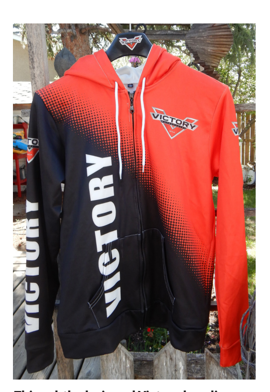
This subtly designed Victory hoodie with muted colours and graphics is still available, believe it or not. Best viewed with sunglasses. Size Small/Medium. Offers? Otherwise going in the Vicmas Christmas Gift Exchange. Can't say you weren't warned.