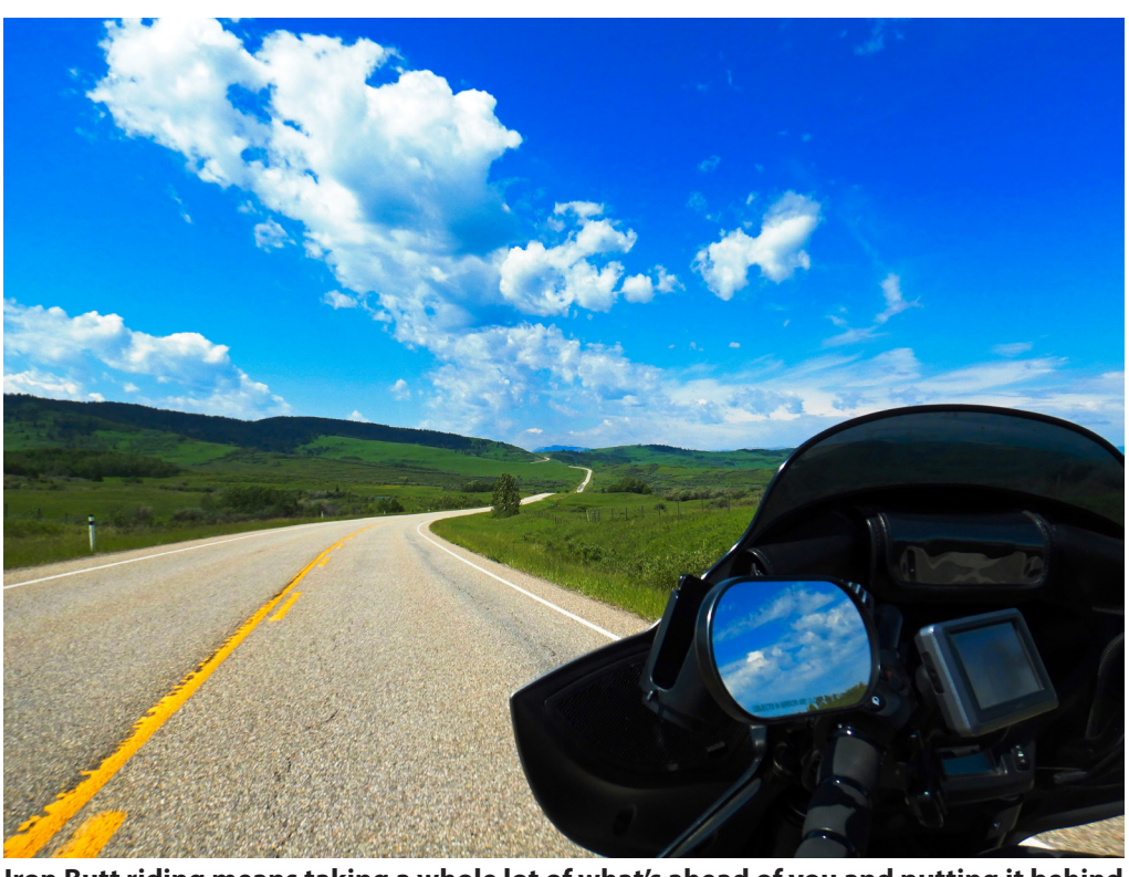
Iron Butt riding means taking a whole lot of what's ahead of you and putting it behind you. Road Captain Jumpmaster is planning to do the 1600kms in 24 hours Iron Butt and is looking for other riders. Are you up for it?