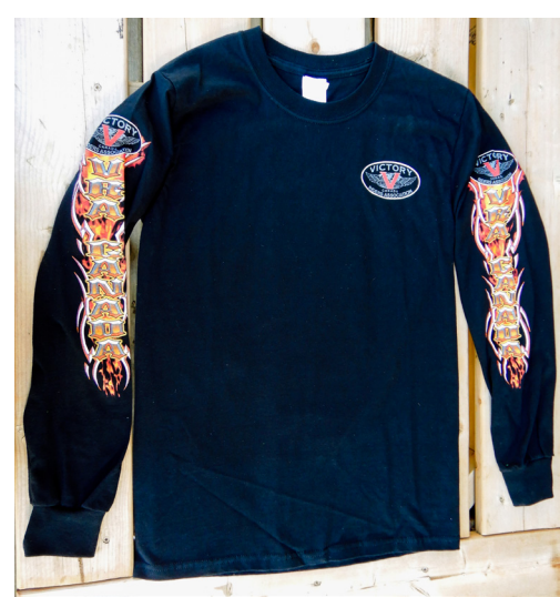
Two size Small black Victory Riders Association vintage long-sleevers left. VRA oval logo on front. VRA Canada artwork on back and sleeves. $10