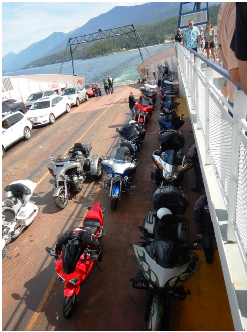
Members of Victory Riders Calgary included a couple of lake cruises in our three day Kaslo Kurves run. The MV Osprey connects the two halves of Highway 31.