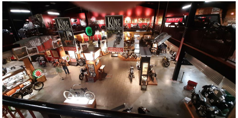
Wheels Thru Time Museum in Maggie Valley, North Carolina, houses more than 300 rare motorcycles, with related exhibits, photos and memorabilia.