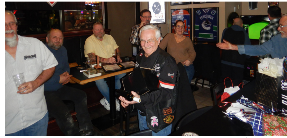
What you chose initially was rarely what you got to keep, as everyone found out.