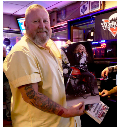
Big Don scored Playboy. Soon stolen.