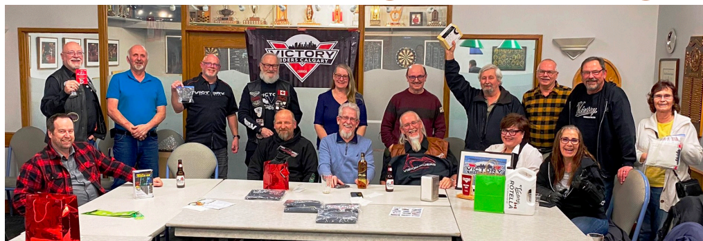
Whether they were celebrating their wins or licking their wounds, VRC members had a good time at the annual Merry Vicmas! gift exchange on January 25.

The tire pressure monitors, the artwork and the spiced rum seemed to be the most desirable and contentious items, changing hands several times during the course of the battle.