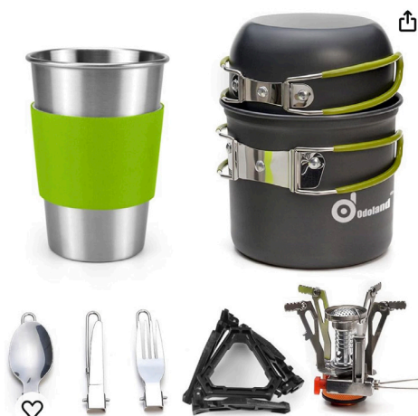
Odoland Camping Cookware Stove set includes pots, cup, folding utensils and folding stand. It uses isobutane fuel canisters

Outside I have a CASCADE MOUNTAIN TECH high back folding chair and probably the second heaviest item at 1.65 kg. It is easy to set up and comfortable considering how low to the ground it is. The ODOLAND Camping Cookware Stove (AMAZON) consists of a 1.2 L pot and 0.6 L pot (neither will hold that much) that create a container to hold the folding stove, 16 oz cup, folding utensils and folding stand. The stove uses ISOBUTANE fuel canisters and one canister has lasted me all year. I like this set so much I keep it in my