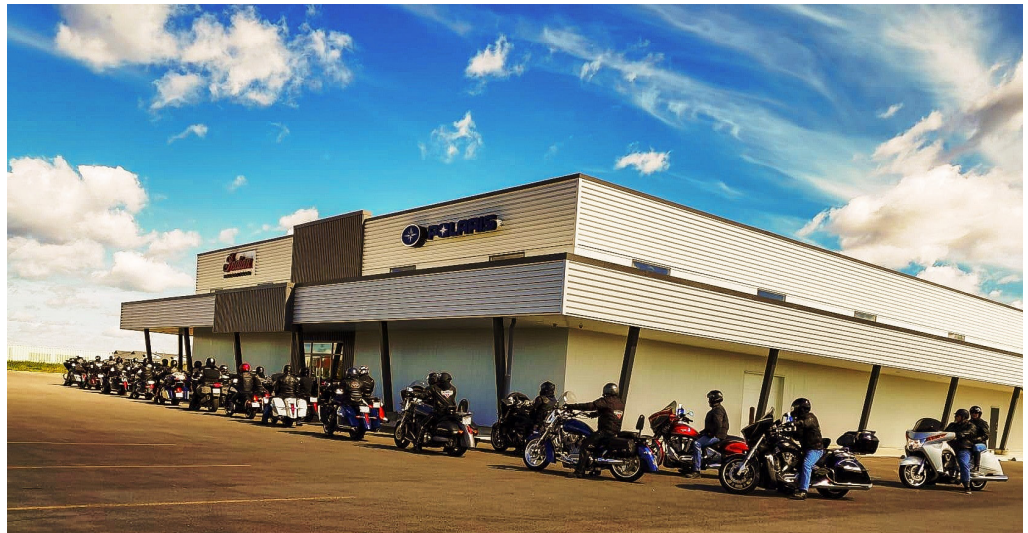
The first Meet In The Middle, in 2020, met up in Red Deer at the Indian dealership. More than 30 bikes rode to Spruce View for lunch at the J-Bar-T.