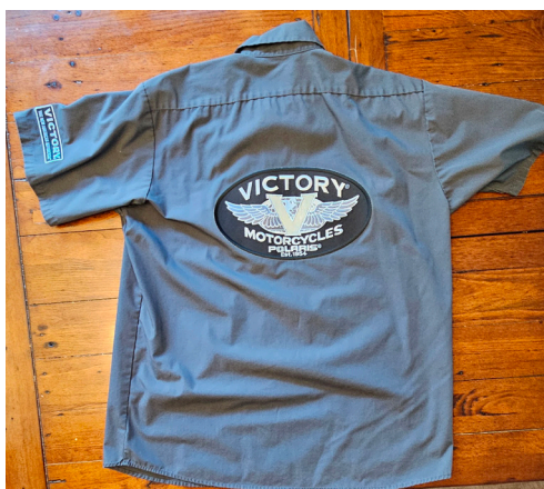
Victory shop shirt, size Large, $30