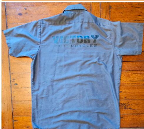
Victory shop shirt, size Large, $30