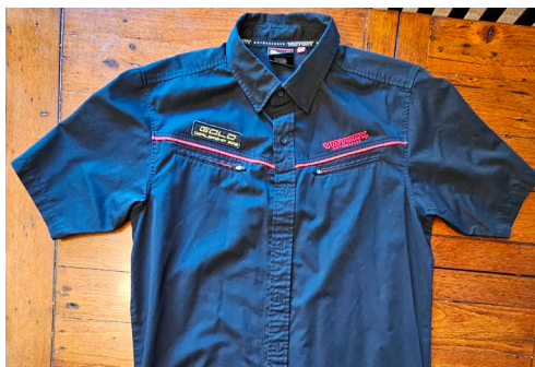
Victory dealer shirt, size Large, $30