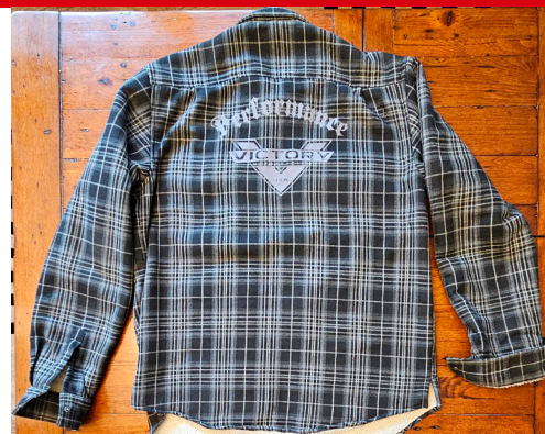
Victory Fleece-Lined Jac Shirt, size Medium, $35