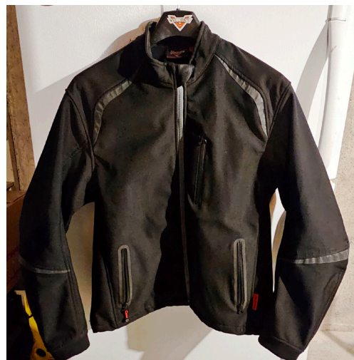
Victory textile jacket, near new, Large, $30