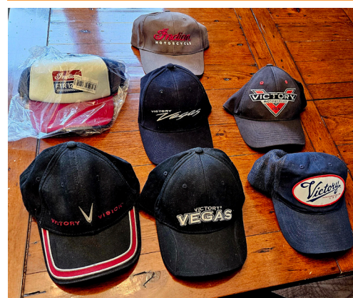
Various Victory and Indian ball caps, $10 to $25.

Collection also includes Arlen Ness shirts (Large); large number of Indian jackets and shirts (M and L) and collectibles; plus helmets (XL); Victory and Indian bandanas; chaps and more.