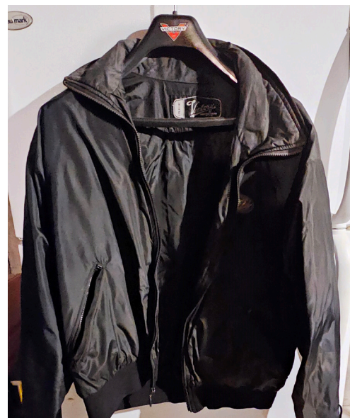
Victory Heated Jacket, no controller, size Large, $30