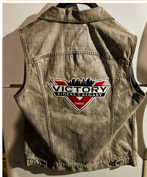
Levi sleeveless denim vest with Club patches, Large, $30